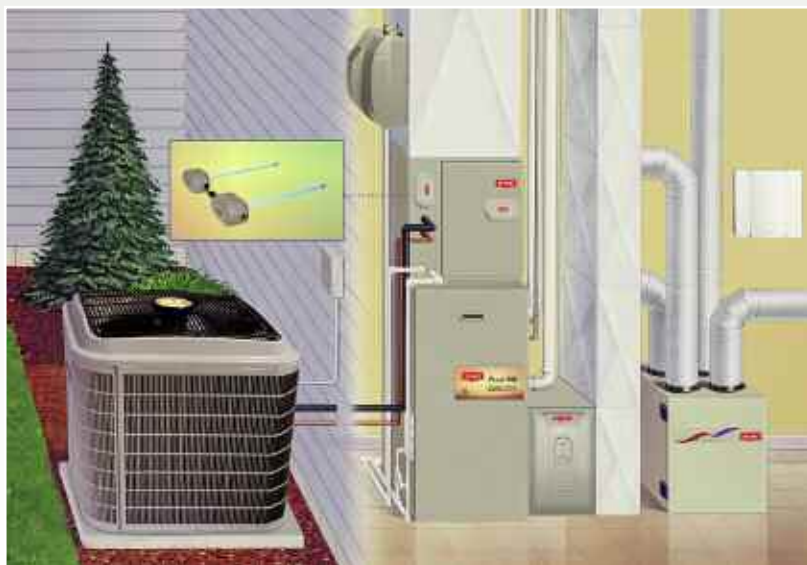
Air Conditioner and Gas Furnace System