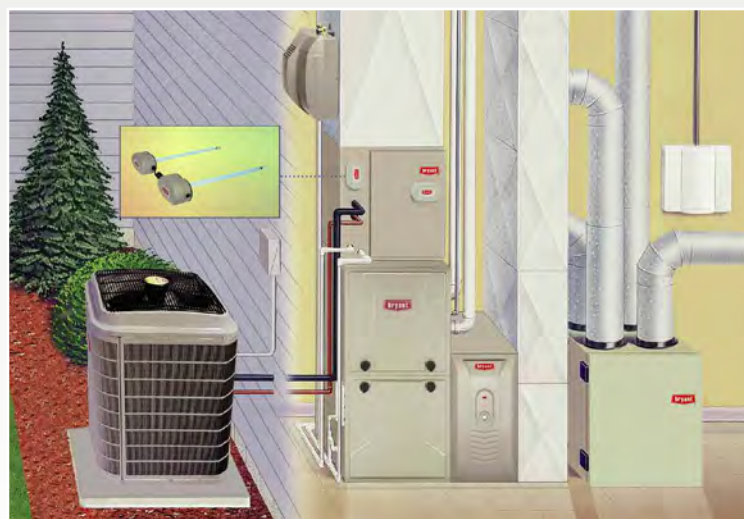
Evolution® V Air Conditioner and Evolution Gas Furnace

Minnesota Heating and Air Conditioning Incorporated 10701 93rd Avenue North Maple Grove, Minnesota 55369 Office: (763) 424-5235 Service Ext. 301 Sales Ext. 302 Fax: (763) 424-8970 Office Hours: Monday - Friday 8:00 A.M. - 5:00 P.M. Saturday 8:00 A.M. - 12:00 Noon