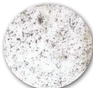
Standard plastic pan with visible mold

Microbes can double every 20 minutes on an untreated surface!