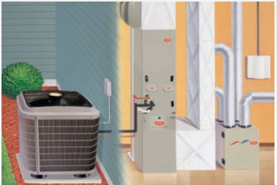
Heat Pump and Fan Coil System

Some models offer DuraCoat™, a special tin plating of the coil to reduce the threat of formicary coil corrosion.