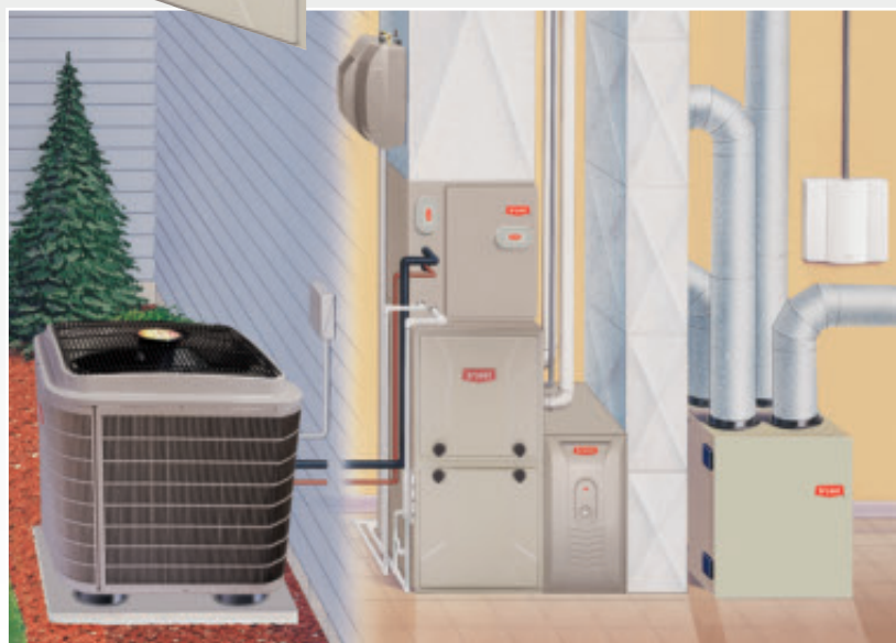
HYBRID HEAT® Dual Fuel Heat Pump and Gas Furnace System

This Box is to be used as a knock-out for a non-varnished area on a full-spread, full-bleed varnish plate.