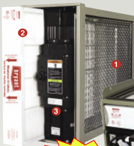
Gas Furnace Model

Patented, state-of-the-art technology kills captured viruses, bacteria, mold spores and other allergens.